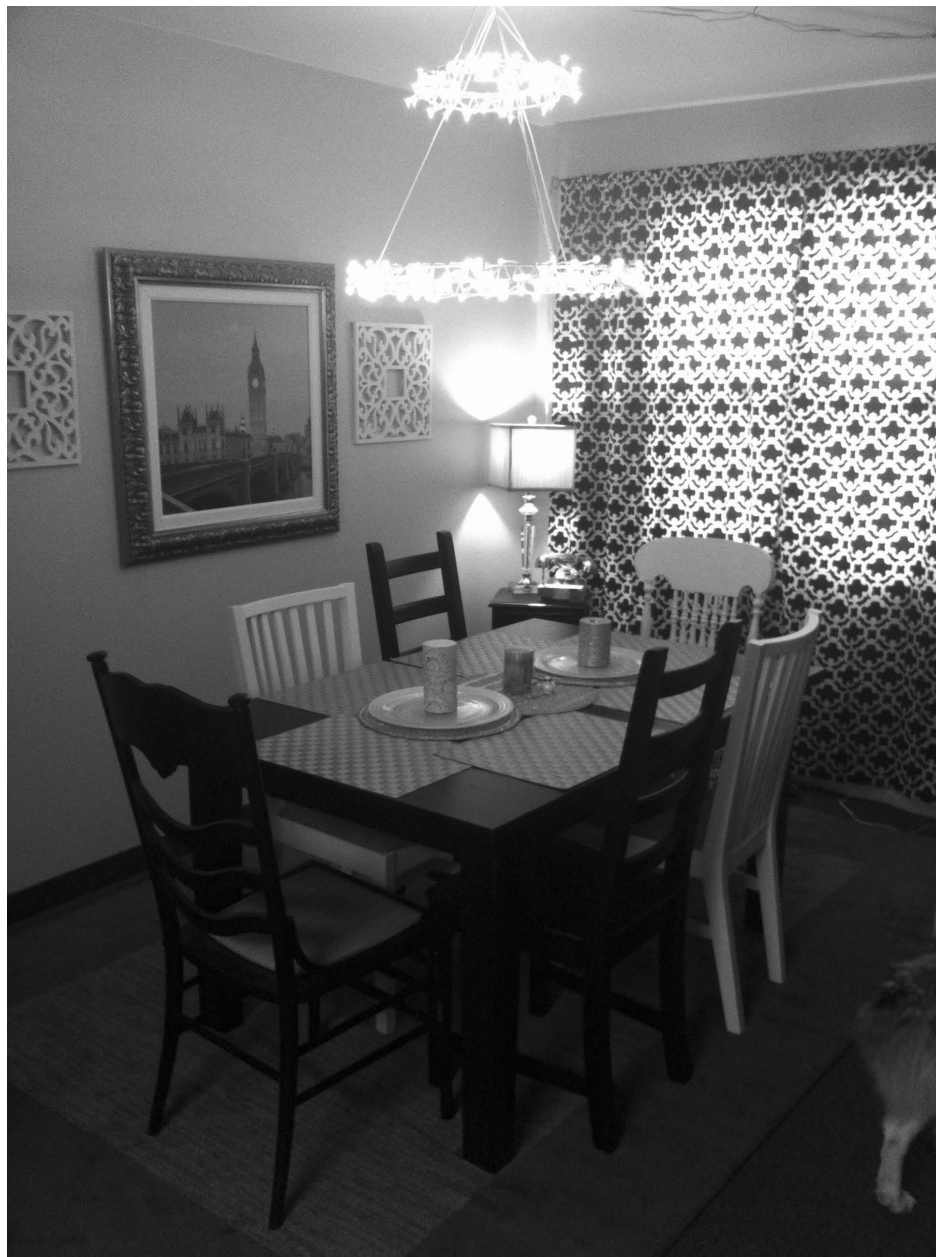
The Keith's home is wonderfully decorated, like it could have come straight off of a Pinterest board.

To learn more about Concordia's special education credential program, attend the School of Education's information night on Feb. 5 from 6-8 p.m. in the 3rd floor Conference Room of Grimm Hall North.