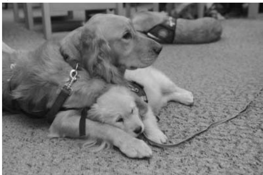
Comfort puppy-in-training Isaiah learns the ropes from veteran Luther

For more information about the dogs—including their social media information—check out the LCC website at http://lutheranchurchcharities.org/ .