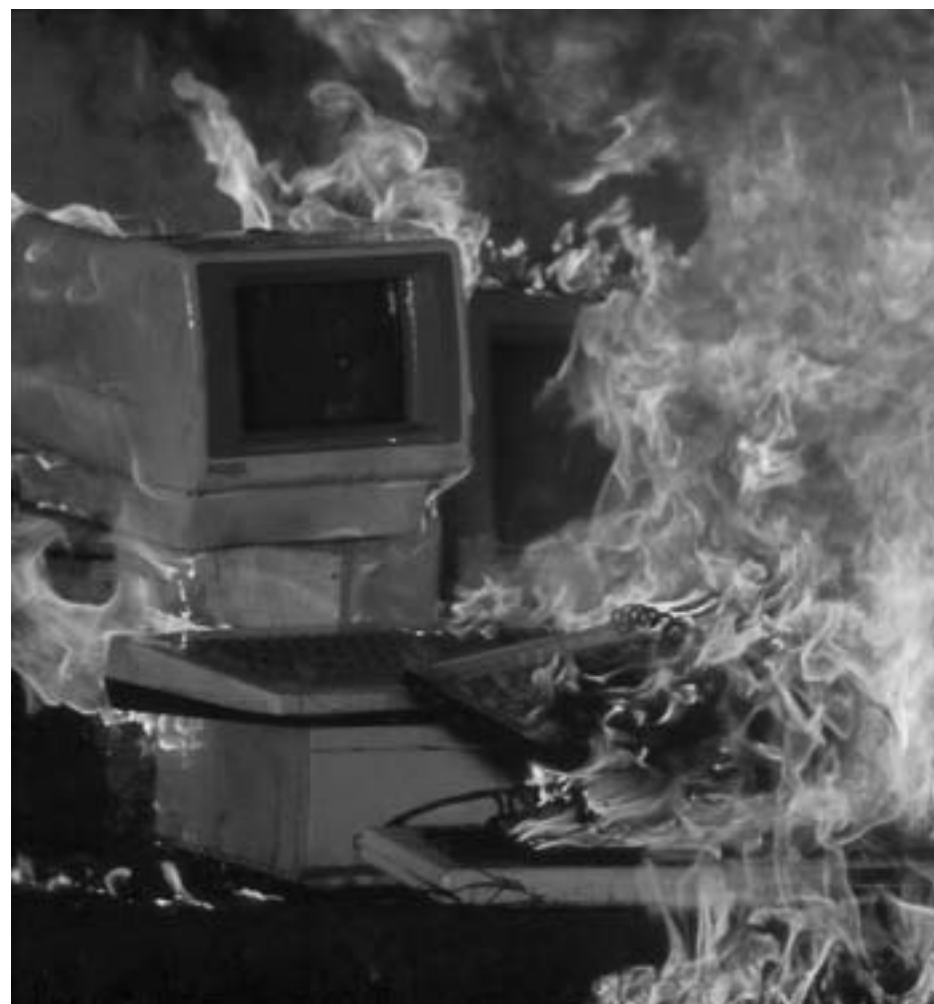
If this happens to your computer, call 9-1-1 immediately. DO NOT contact IT.

There are several ways to contact the IT crowd for technology help. You can call at (949) 214-3175, email them at ITS@cui.edu , fill out an online request at www.cui.edu/its , or visit them in their office, Admin 220. Their office hours are 8 a.m. to 7 p.m. Monday through Friday, 10 a.m. to 3 p.m. Saturday, and 1 p.m. to 7 p.m. on Sunday.