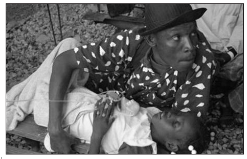
BY BRANDI AGUILAR STAFF WRITER

Since October, 1,600 people have died from a Cholera outbreak in Haiti, thought to be caused by a sewage spill and other environmental conditions. An additional 29,800 people have been hospitalized with the disease.