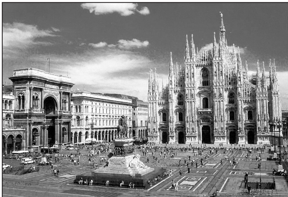
The Duomo Cathedral is one site Milan exchange students can explore during their study abroad.