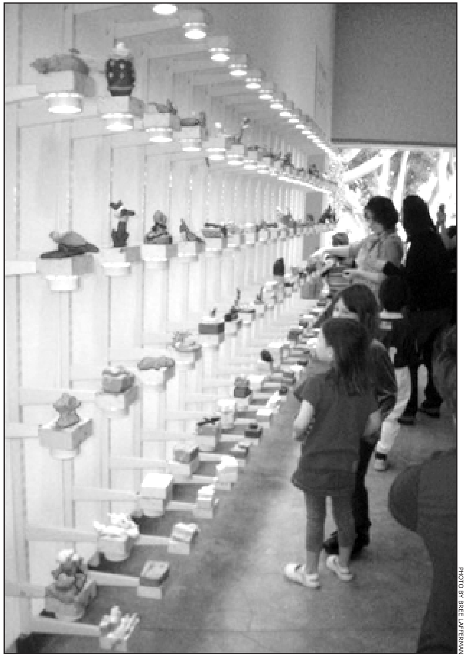
Art appreciators of all ages enjoy the Orange County Museum of Art's interactive clay exhibit.

Both "Charles Long: 100 Pounds of Clay," and "15 Minutes of Fame: Portraits from Ansel Adams to Andy Warhol" will be at the Orange County Museum of Art until Sept. 19. For more information visit OCMA's website at www.ocma.net .