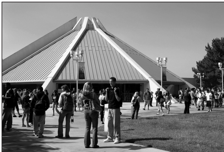
Students, faculty and staff gather around the CU Center following a chapel service.

Concordia is known for not forcing students to go to chapel in keeping with their understanding of Christian freedom and faith without mandate.