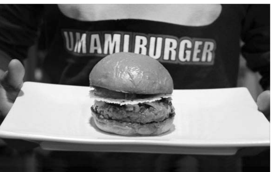
Ooh mommy! This umami burger is sure to thrill.

it needs to do a little better than 'really good.' That being said, the food, the display, the atmosphere, and the music all make this a must try location. It really is a fun and entertaining experience!