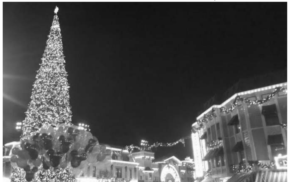
Main Street gets even brighter than usual with a tree and Christmas lights.

Check out these Holiday festivities before the Christmas season ends Jan. 6.