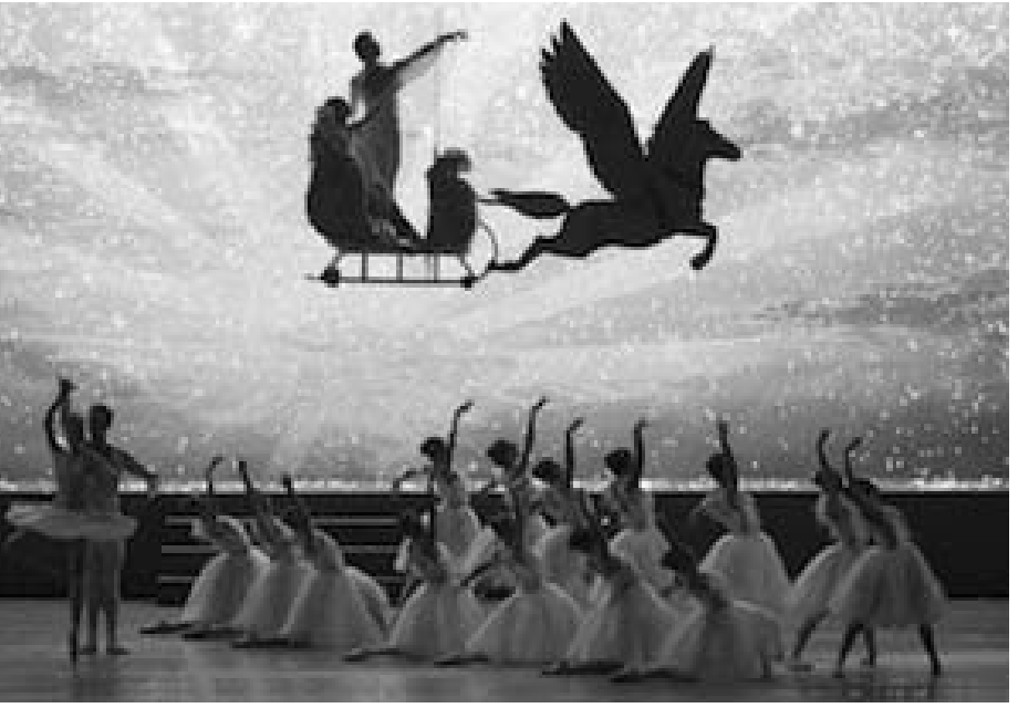
The Long Beach ballet gives a beautiful performance.

"The Nutcracker" opens at the Terrace Theater at the Long Beach Performing Arts Center starting on Sat., Dec. 15. Show times are at 2 p.m. and 7:30 p.m., as well as the following weekend at the same times. Tickets can be purchased online through TicketMaster or at the Long Beach Performing Arts Center Box Office. For more information, visit the ballet's website at www.longbeachballet.com.