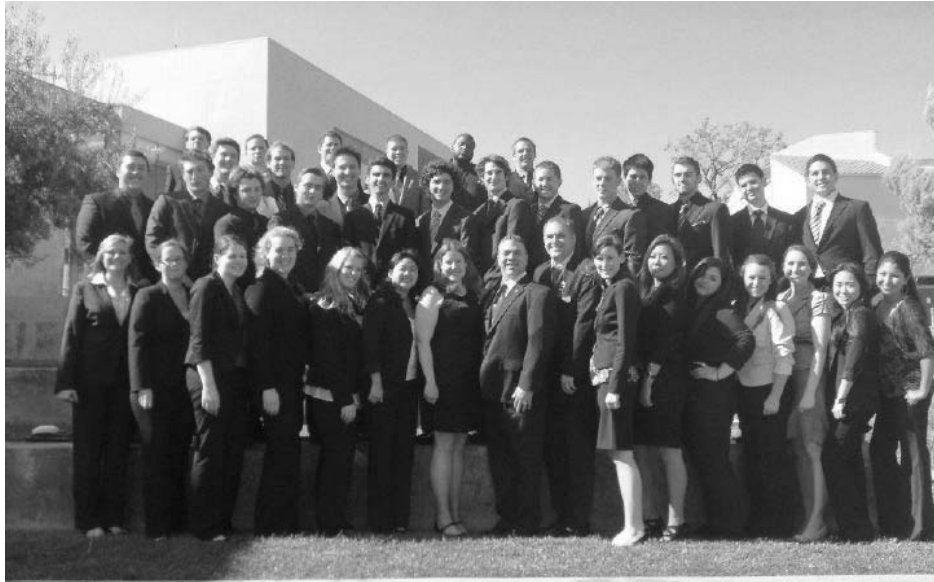
The fraternity's founding class