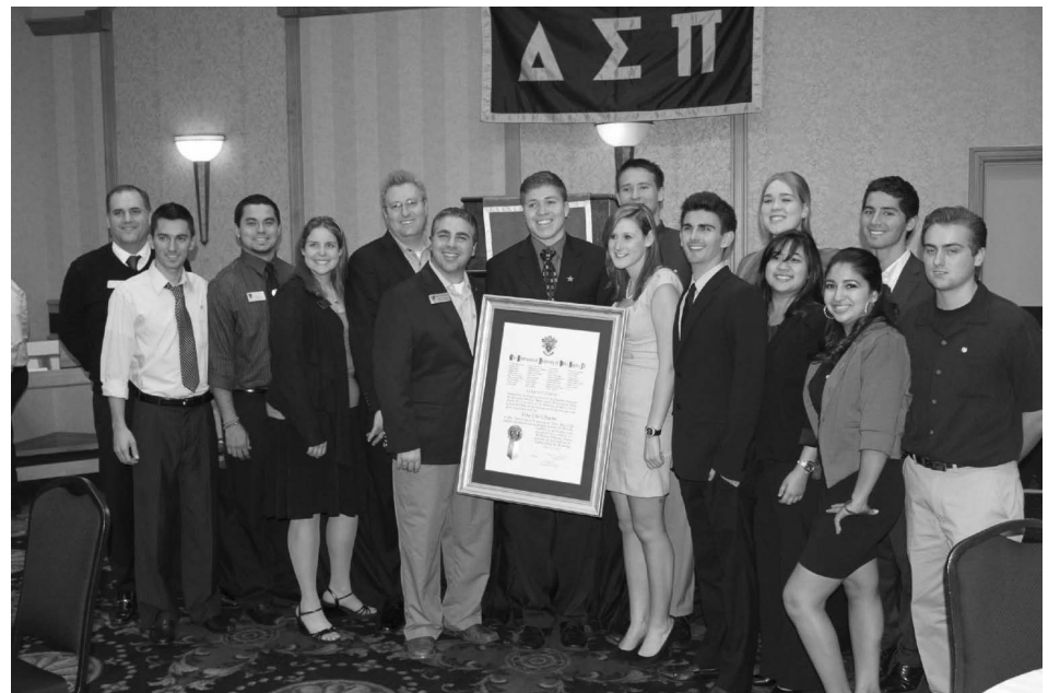
The Concordia business fraternity receives its Rho Phi charter in Denver, CO

This lecture was part of a blooming interest in the science of Astronomy by Concordia. As well as the new Astronomy class, there is talk of a new science building in the works and potentially an observatory.