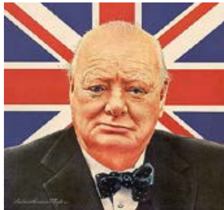
Don't disappoint this man!